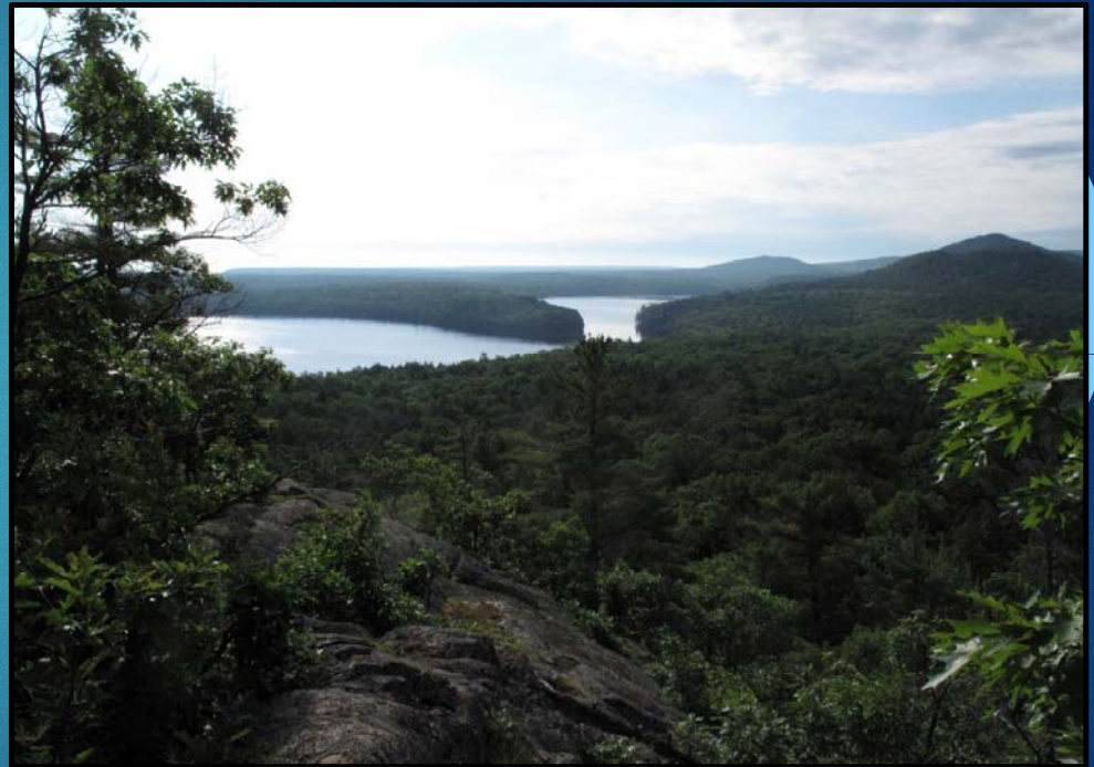
Huron Mountain View from inside the club