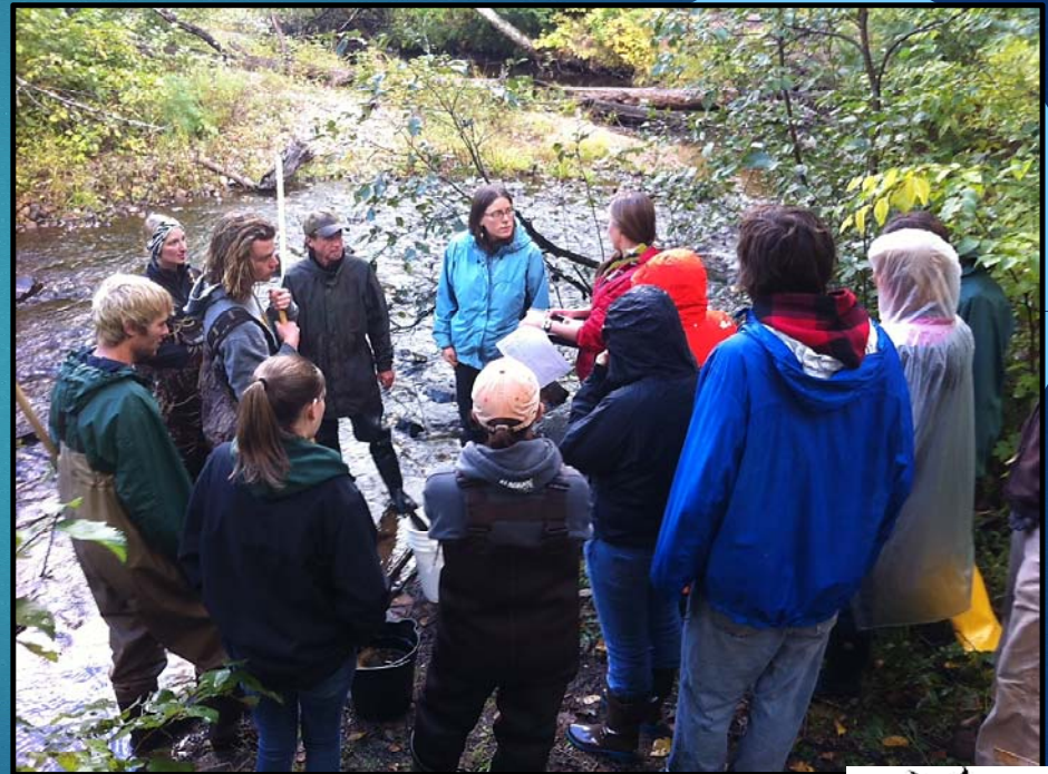
The first Salmon Trout Volunteer Monitoring Training Fall 2012