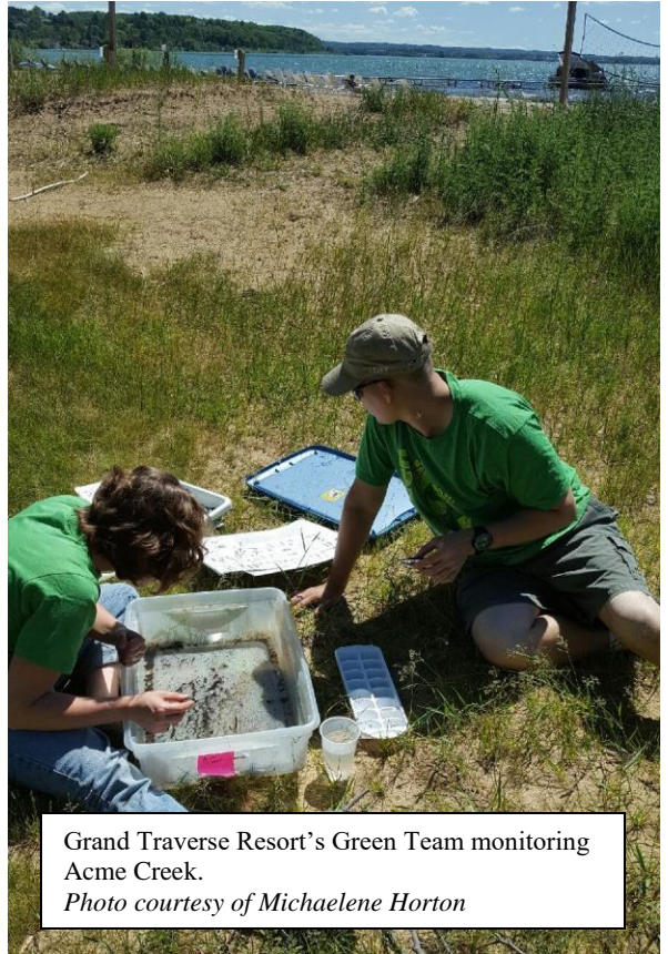
Grand Traverse Resort's Green Team monitoring Acme Creek.